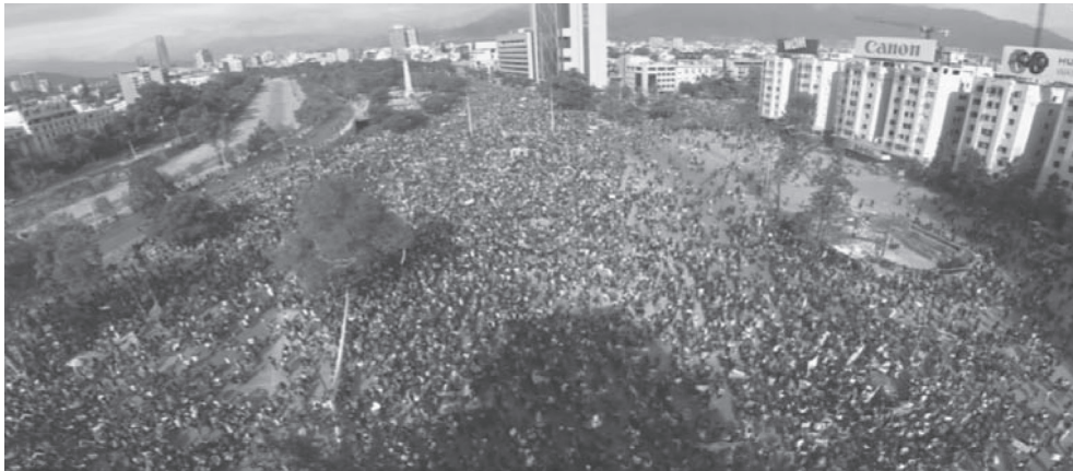
Figure 2. Protests in Plaza Italia, Santiago de Chile, 1 November 2019.

ment at approximately 8%. Nevertheless, a month later 1.2 million people (in a city of 7 million inhabitants) marched, demanding a New Social Pact, where the fruits of development would reach all.