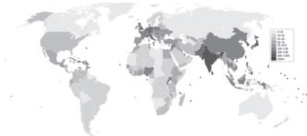
Figure 1. The percentage of urbanized population by country (2018 data).