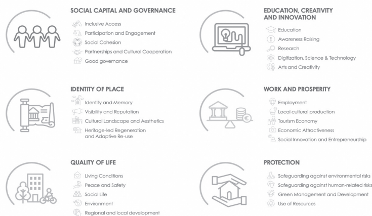
FIG. 2 – SoPHIA model – Themes and subthemes.

The description highlights the aim of the assessment, and the related specific issues.