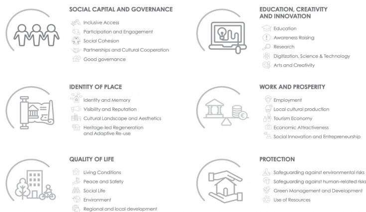
FIG. 2 – SoPHIA model – Themes and subthemes.

The description highlights the aim of the assessment, and the related specific issues.