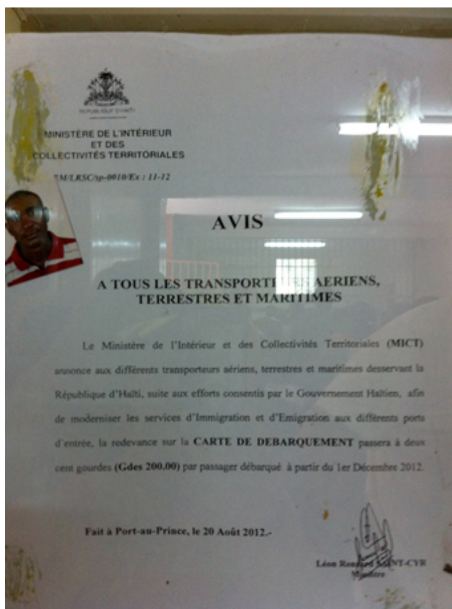
FIG. 5. A notice posted by the Haitian Ministry of the Interior and of Territorial Collectivities informing all Air, Land and Maritime transporters that there is a 200 Gourdes fee for a Debarcation Card.