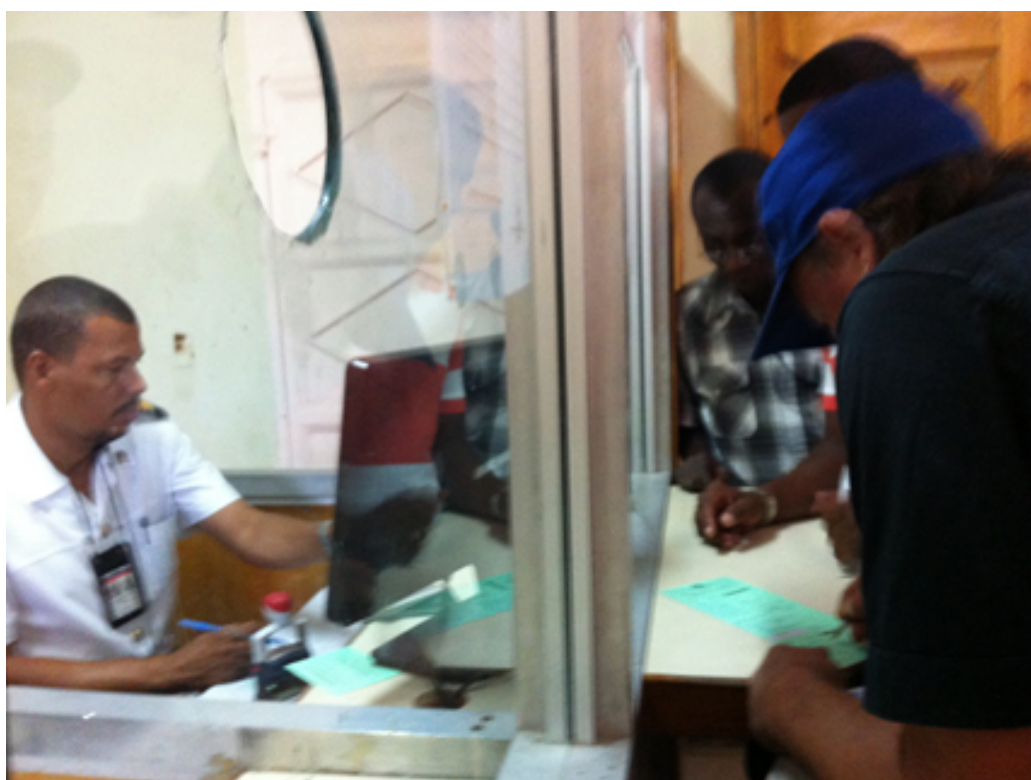
FIG. 8. The Haitian Immigration Officer at work.