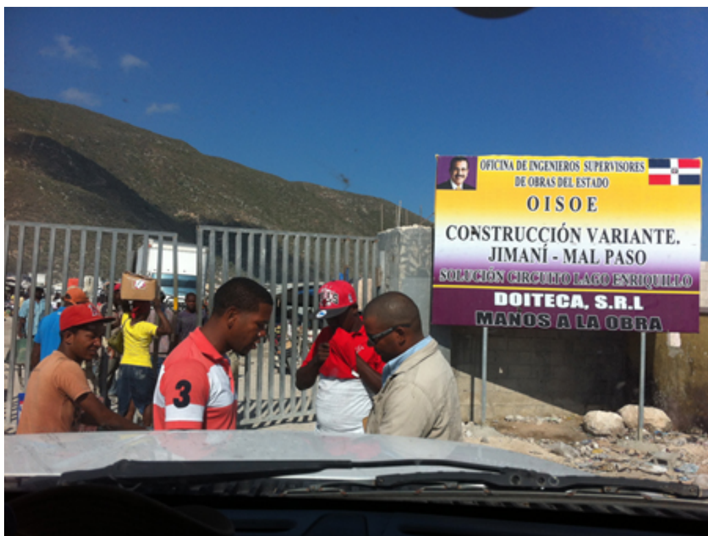
FIG. 7. Money changes hands between our “escort” and some kind of “official” – soldiers open the gate, under a billboard promoting a construction project by the Dominican President.

various national ministries in each country, here on the border we cannot even identify national authorities to communicate with. We are reduced to dealing with local actors, translators, money-changers and guides who seem to have their own agendas and little regulation. They have taken advantage of the structural holes of the absent state to catch a large fish in their net.