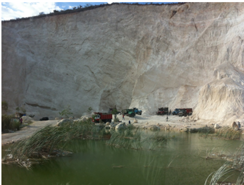
FIG. 4. Gravel and sand mining is eating away at the mountainsides, as the lake water rises, threatening the road, next to National Highway 3, Haiti.