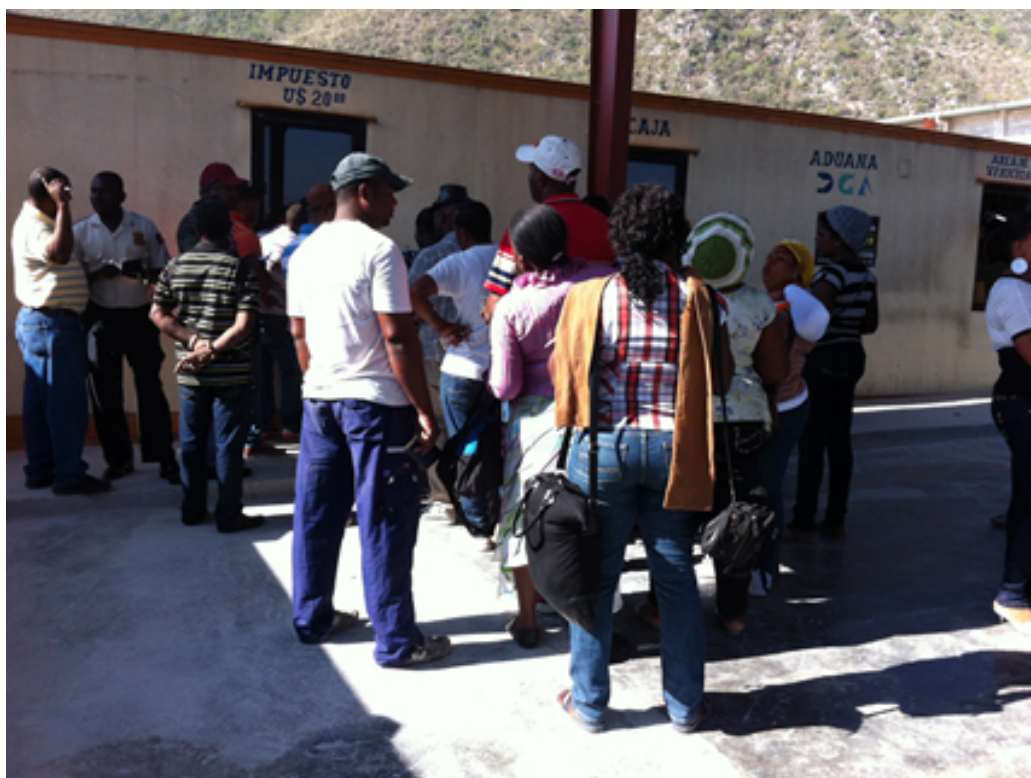
FIG. 9. Haitians waiting to get into the Dominican Republic, paying a fee posted in US$ rather than either gourdes or pesos (which are equivalent in value).

Our double transit across the Haitian-Dominican border seems to have contributed to the sociocultural practices that reproduce that border dividing the island into two state territories. It certainly triggers a point of passionate interests. Our Haitian colleague mentions the 1937 massacre as we approach the frontier, and once in Jimani we see sharp social divides between Haitians and Dominicans, some of whom also seem to blame each other for the deforestation which they believe may be contributing to the rising of the lakes. Despite the thousands of Haitians who live in the Dominican Republic, working in menial jobs, many undocumented, stateless and now especially subject to deportation since the passage of the new citizenship law, neither nation can imagine a time when this border will not divide them, when Ayiti will be one again (Figure 9).