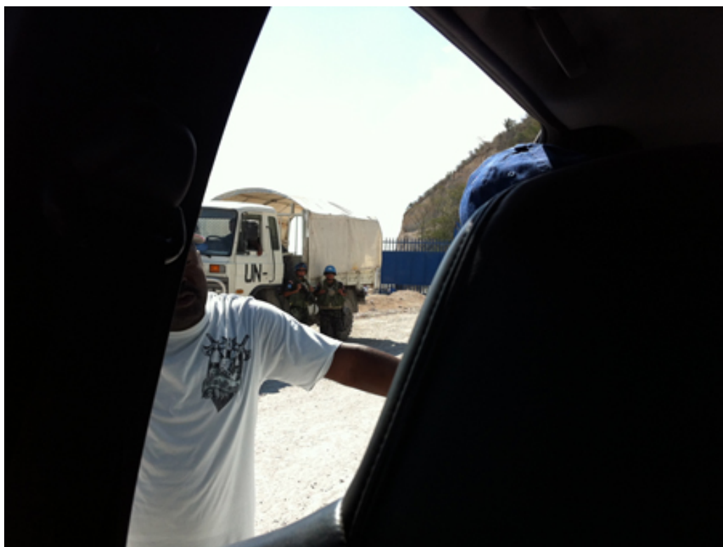
FIG. 2. United Nations MINUSTAH troops parked alongside the border crossing between Haiti and the Dominican Republic, as our driver addresses an unidentified Haitian national authority wearing a t-shirt.

cards, uniforms, and signs of power, but at no point is it clear where or with whom national authority rests.