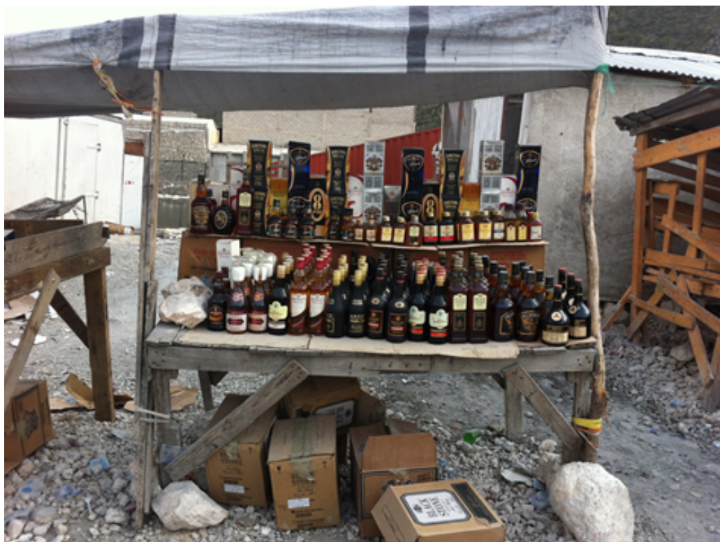
FIG. 3. A stand selling duty-free alcohol in the border zone.

across the gate; there do not seem to be any officials interested in what we are doing, and no one questions our Dominican colleagues who walk through the gate to give us the equipment. We retreat back the way we came quickly, again passing through all the blue metal gates without stopping and without questioning.