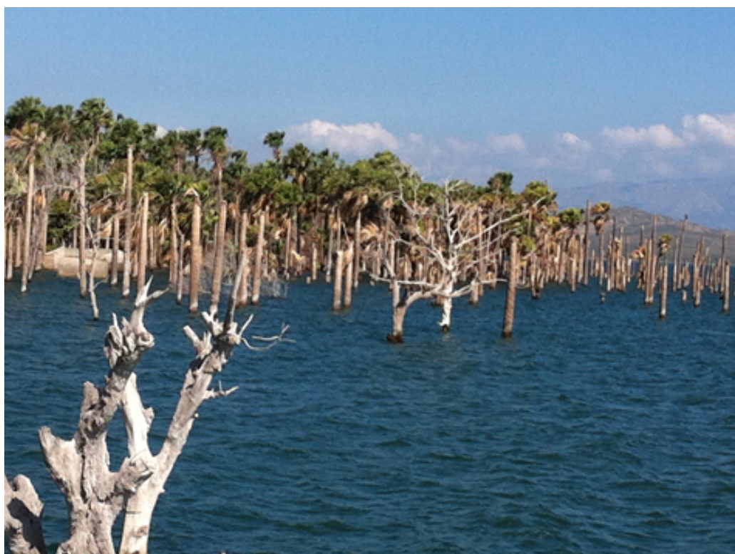
FIG. 1. Lake Azuei in Haiti overflows its shores, swallowing up trees, fresh-water springs, houses and farmland near the town of La Source.

nial powers, it unified the entire island of “Ayiti” (known to Europeans as Hispaniola) during the presidency of Jean-Pierre Boyer, from 1818-1843. The Dominican Republic finally declared its own independence from Haiti in 1844, and its historians describe this period as an occupation. Both states, however, were later subject to outside occupation and control: the U.S. Marines occupied Haiti from 1915 to 1934, and occupied the Dominican Republic from 1916 to 1924. While both countries were under US control, the American-owned sugar industry expanded by displacing Haitian peasants from their land and then importing them as low-paid laborers into the Dominican Republic to work on sugar plantations for 20-30 cents a day [Richman 2005, 53]. Between 1916 and 1925 it is thought that around 150,000 Haitians crossed the border, undocumented, in what one historian describes as “virtual osmosis” [Lundahl 1983, 119; cited in Richman 2005].