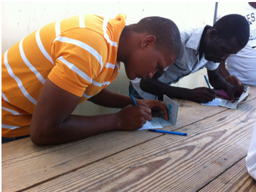
FIG. 6. Men filling in our immigration cards at the Dominican border, which they will hand over to be stamped, along with US$30 per person.

permits ($50), insurance documents (5000 pesos), tax receipts, landing cards, and above all: open gates (Figure 7). At each point tensions rise, men stand toe to toe. We feel duped, and powerless. At the border, the fiction of the state's legal construct of territoriality as exclusive jurisdiction is evident as a multitude of quasi-authorities, illegal actors, breakdown of trust, and communicative confusion. A kind of informal jurisdiction abounds, that is loosely allied with the state, but also exceeds or escapes state control.