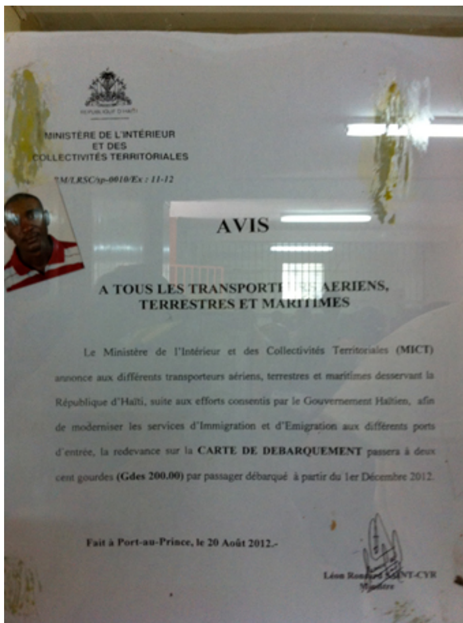
FIG. 5. A notice posted by the Haitian Ministry of the Interior and of Territorial Collectivities informing all Air, Land and Maritime transporters that there is a 200 Gourdes fee for a Debarcation Card.