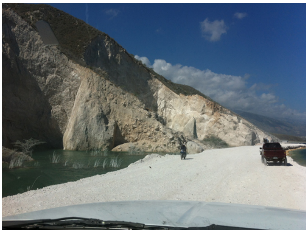
FIG. 10. The lake is eating the national highway, and the land around it; soon there will be no more possibility for a border crossing here.

The road holds for now, but only by a thread (Figure 10). It is a temporary construction, a semiotic handle of state sovereignty as temporary as the border itself. For now the trucks and people, motorbikes and goods, continue a stuttering but steady flow between the two countries along this tenuous route, but all are aware they are ultimately subject to the “natural” jurisdiction of the lakes.