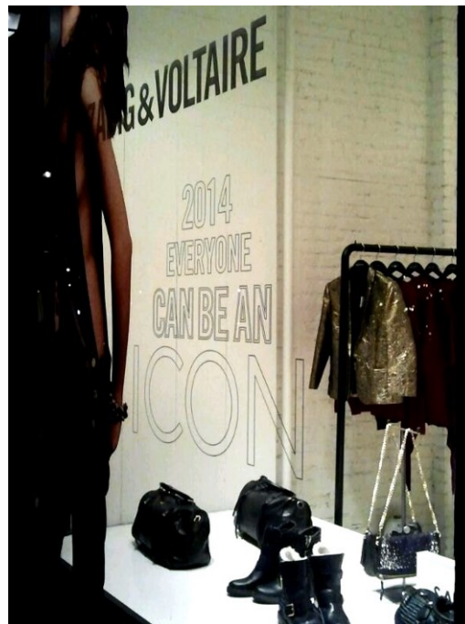
FIG. 2. (Zadig & Voltaire) Shop Window: “2014: Everyone Can Be an Icon,” West Village, NYC, January 2014.

But does this all mean that we are entering a “post-iconic” age in which, as this now-famous Time magazine cover (Fig. 1) claims, everybody – even “you” – can be