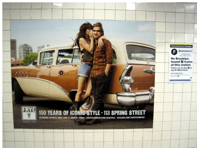
FIG. 3. (Frye) Advertisement in the Subway: “150 Years of Iconic Style,” Brooklyn, NYC, December 2013.

the “person of the year,” or, as this New York City shop window (Fig. 2) suggests, “everyone can be an icon”? Maybe even showing off your own “iconic style,” as this (gender) advertisement (Fig. 3) wants you to believe, or better buy?