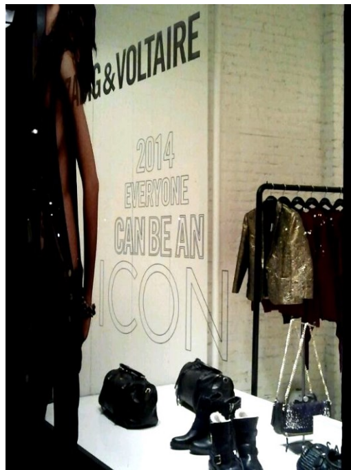
FIG. 2. (Zadig & Voltaire) Shop Window: “2014: Everyone Can Be an Icon,” West Village, NYC, January 2014.

But does this all mean that we are entering a “post-iconic” age in which, as this now-famous Time magazine cover (Fig. 1) claims, everybody – even “you” – can be