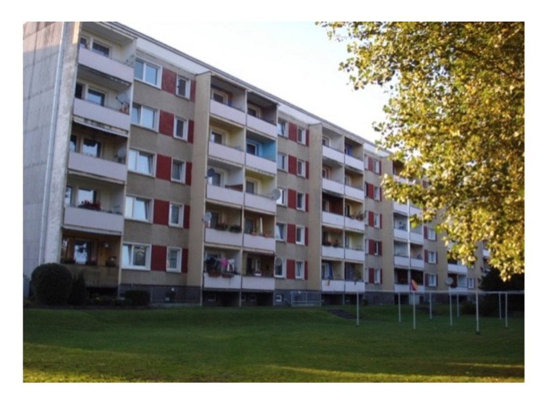
FIG. 2. Prefabricated buildings dominate Genthin Süd.

Social conflicts, xenophobic attitudes in the host society and institutional discrimination characterise the communal life of locals and repatriates in Genthin. Even though there is no strong organisation of right-wing groups, Genthin is certainly defined by hidden resentment towards foreigners. Within the study, some repatriates state that they are often treated with hostility because they speak Russian. But this form of xenophobia is not recognised by administrative bodies. There is a very limited understanding of xenophobic attitudes, which is also reflected in the officials' understanding of integration: Integration in Genthin means the assimilation of foreigners. Genthin's society negatively perceives the living of original lifestyles, traditions and languages, which results in a discrepancy between locals and immigrants. Even though the number of late repatriates has declined due to the ongoing rise in vacancy in Genthin's social housing areas and the repatriates' increasing access to other neighbourhoods in Genthin, Genthin Süd has become the city's migrant neighbourhood, which not only concentrates repatriates but also socially weak households. Hence, as the major of Genthin argues, this district has developed to a residential area of "socially excluded inhabitants" (Major Genthin, 2011).