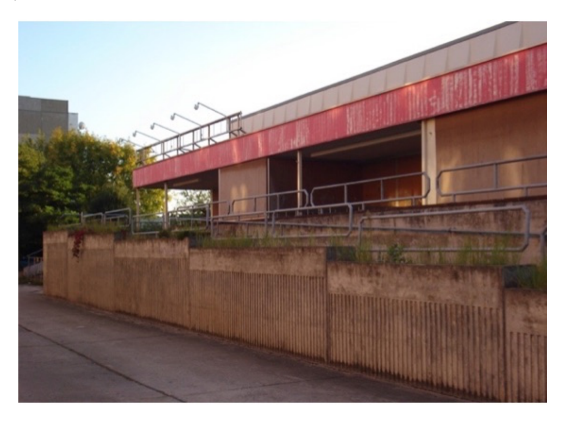
FIG. 3. Decline of facilities for daily needs.

Indeed, the majority of Genthin's approximately 450 late repatriates are located in Genthin Süd. However, there is no data on the number of residents with a migrant background who actually live in that neighbourhood. In total, Genthin Süd houses around 1,900 inhabitants. Even if all of the repatriates live in this neighbourhood, it would be a share of 23 per cent. Remarkably, all of the interviewees (including late repatriates) assumed that the share of repatriates would be between 40 and 80 per cent. This represents Genthin Süd's image of an ethnic neighbourhood and proves Dangschat's [2007a, 43] argument that the host society sees the concentration of often unwelcomed migrants as a danger, and, thus, it assumes that the numbers are higher than they actually are. Also, a social consultant in Genthin Süd argues that Genthiners tend to perceive masses of migrants as a result of xenophobia and social envy (Social Consultant, 2011).